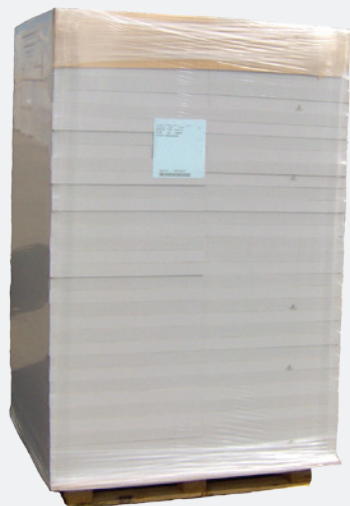
Packing of standard boards